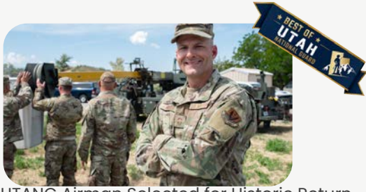
UTANG Airman Selected for Historic Return of Air Force Warrant Officer program