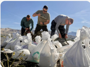
The Weight We Carry: Survivor Strive Challenges Guard Members at Camp Williams