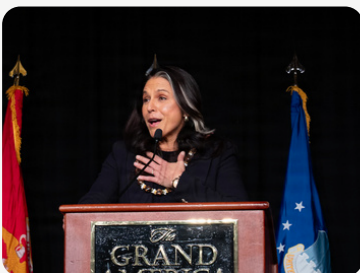
From Translation to Strategic Insight: National Intelligence Leaders Convene at Utah's 8th Annual Language Conference