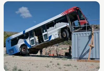
VIDEO | UTNG Exercise Wolverine 2026: Simulated Refinery Explosion & Rubble Extraction Operations