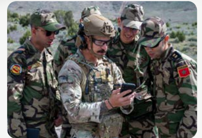
UTNG Integrates Air and Ground Capabilities in Exercise Wolverine Disaster Response Training