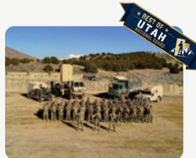
"America's Thunder" Wins Alexander Hamilton Award for 2025