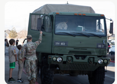
UTARNG Helps Communities through Transporting Food Donations to Local Food Pantries during Scouting for Food