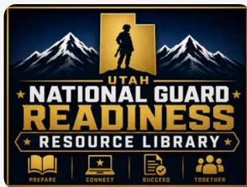
From travel to individual & family protection, check out the new resource library for readiness posters and tools