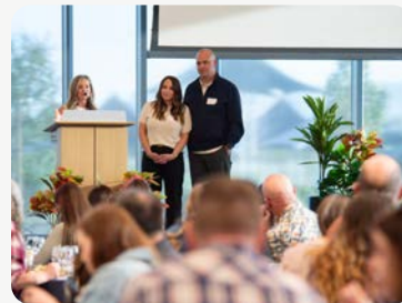
UTNG Hosts Spouse Night, Strengthens Connections & Increases Family Readiness