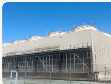
VIDEO | UTNG Exercise Wolverine 2026: Defending Critical Infrastructure from Cyber Threats