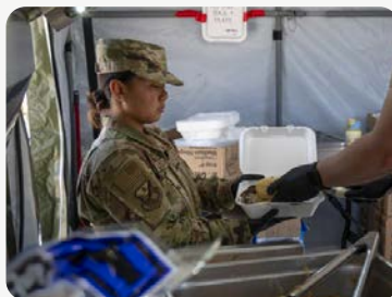
Utah Air National Guardsmen Innovate Meals for Training