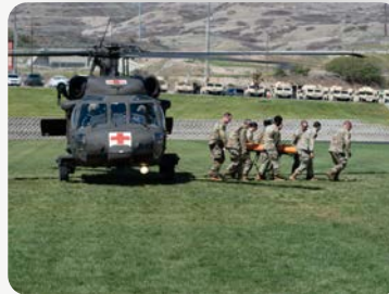
UTNG Conducts Medical Operations in a Contested Homeland During Exercise Wolverine

EXERCISE WOLVERINE VALIDATED CRITICAL CAPABILITIES, STRENGTHENED ESSENTIAL PARTNERHSIPS AND EMPHASIZED PREPAREDNESS FOR THE NEXT REAL-WORLD CRISIS