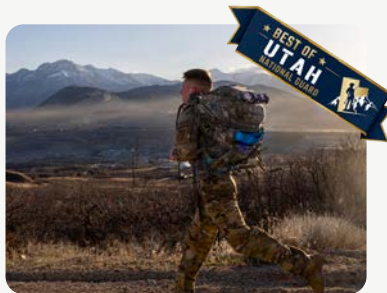
Utah National Guard Best Warrior Competition Showcases Strength of the Warrior Core