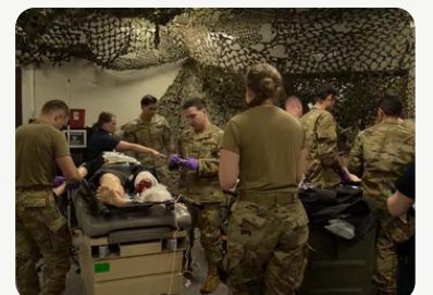
VIDEO | UTNG Exercise Wolverine 2026: Integrated Medical Training at the MSTC, Camp Williams