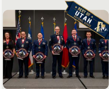
UTANG Honors The Airmen of the Year 2025