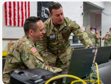
UTNG and Local Partners Respond to a Simulated Cyberattack during Exercise Wolverine