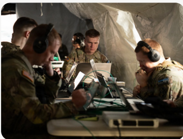
Training for Every Theatre: Linguists Gather in Competition