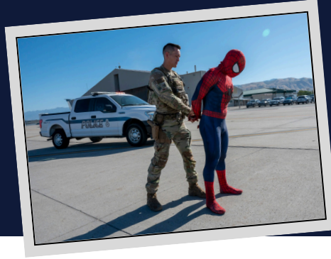
Wingman Day - Salt Lake City