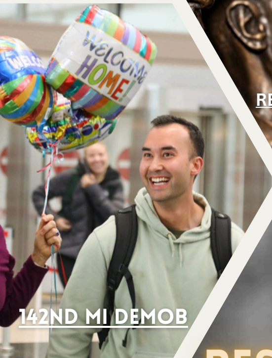
142ND MI DEMOB