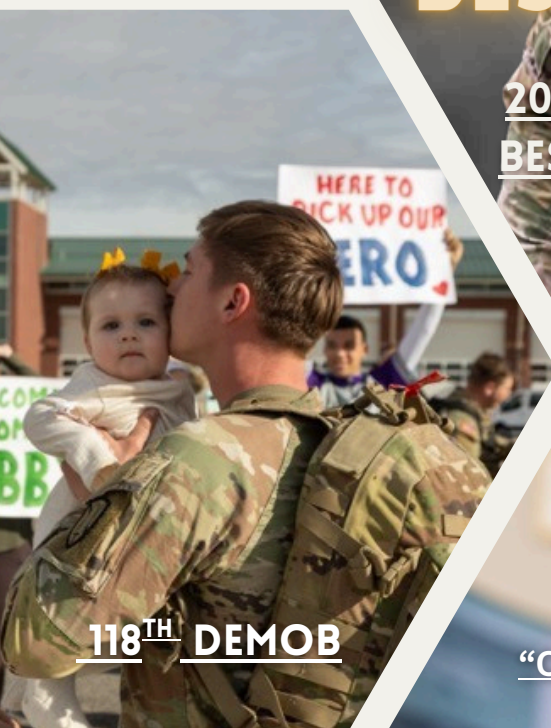
118 TH DEMOB