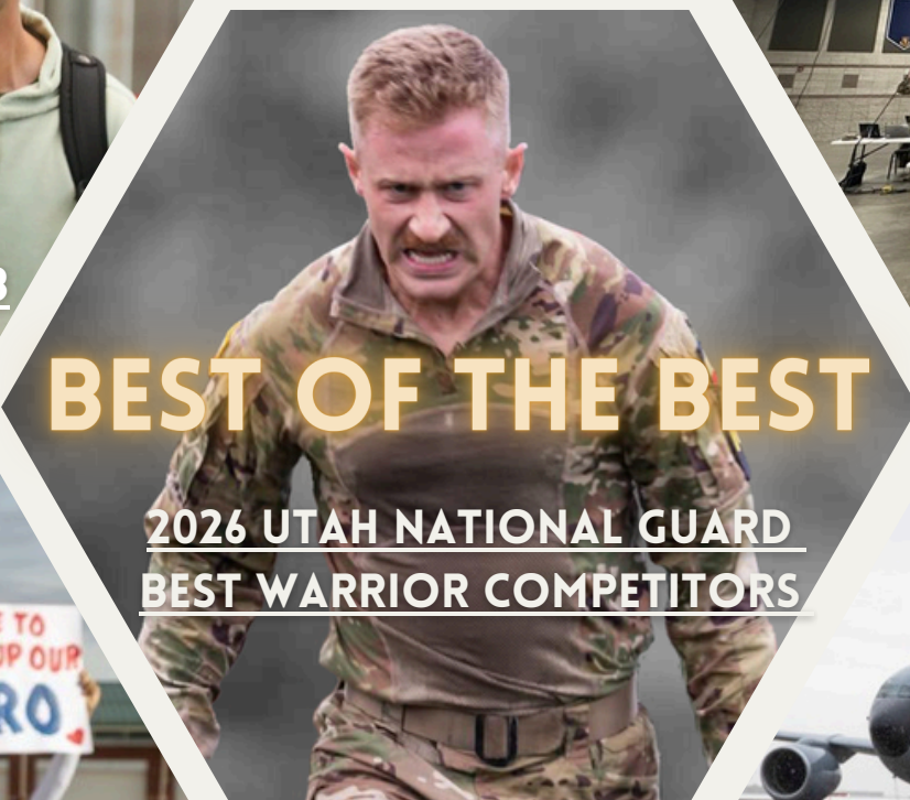
2026 UTAH NATIONAL GUARD BEST WARRIOR COMPETITORS