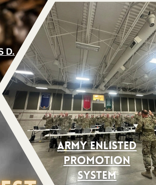
ARMY ENLISTED PROMOTION SYSTEM