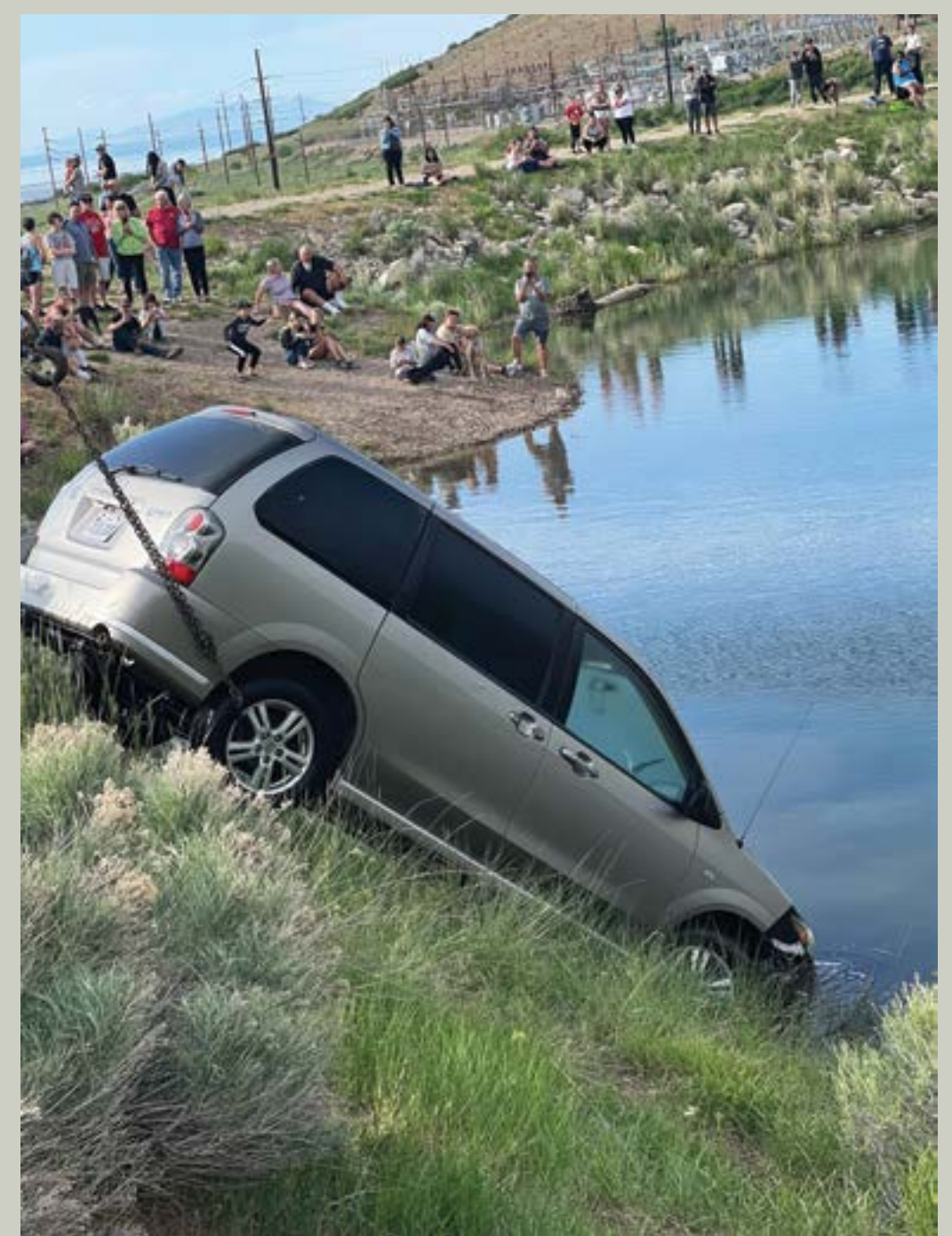
Crews remove a submerged minivan from the bottom of Settlement Canyon Reservoir, Jun. 3, 2023.