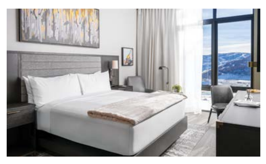
View of Jordanelle Reservoir from room with one king-size bed and a twin sofa bed.