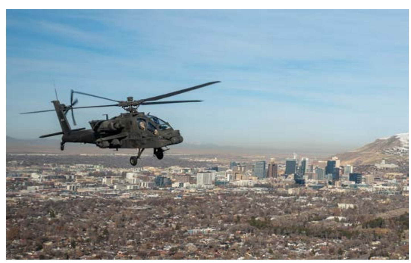
Above: A Utah Army National Guard AH-64 Apache flies over the Utah Capitol as part of the inauguration ceremony of Gov. Spencer Cox, the 18th governor of Utah. The Utah National Guard showcased its AH-64 Apache, UH-60 Black Hawk, and UH-74 Lakota helicopters as they flew over the closing of the inauguartion ceremony, Jan 6, 2025. Below: A AH-64E enroute to fly over the inauguration ceremony of Gov. Cox, Jan 6, 2025.