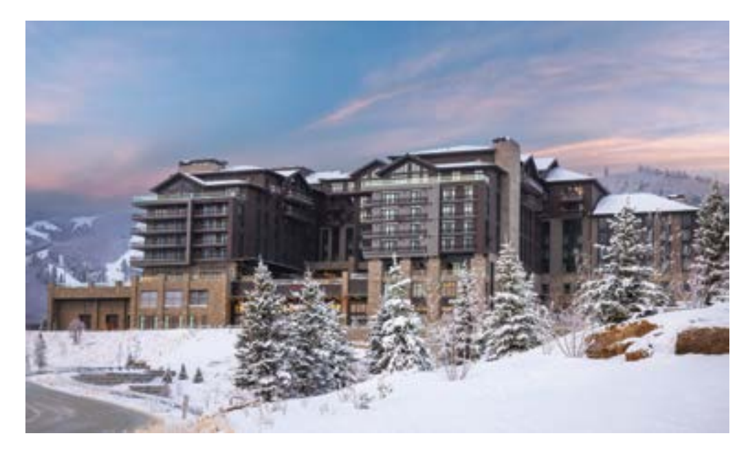
Grand Hyatt Deer Valley with view of Deer Valley Resort.

bedroom condos. The condos are beautiful and full of lavish amenities. In addition, there is a small lounge on the lobby floor which is reserved only for military affiliated members and provides a quiet place to relax and enjoy the mountain atmosphere. Whether your stay takes you to the snow-covered ski slopes during Utah's winter or to the miles of biking trails that span the aspen forests, grasses and wildflowers of this mountain paradise, you will find the stay relaxing and enjoyable. With Jordanelle Reservoir just across the street and the Uinta mountains a few more minutes to the east, and Park City's high-end dining and shopping a few minutes west, you will be staying in one of the most central areas to some of Utah's best recreational opportunities.