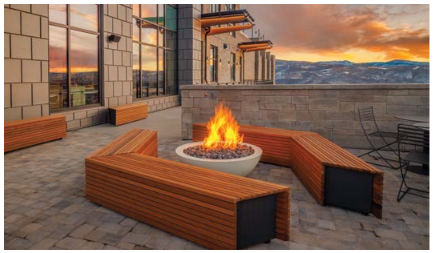
Large patio with fire pit and view of Jordanelle Reservoir.

Now, more than 20 years later, and with the help of Utah's Military Installations Development Authority that promise is fulfilled. A new public - private partnership was established between landowners, developers, city and county governments and the DOD, a world-class facility was constructed with service members in mind. The new Deer Valley East Village along with its Grand Hyatt Deer Valley hotel and resort has partnered with the DOD to provide discounted and affordable rates on rooms, rentals, and other amenities for service members who choose to use the facility. Officially opened for business in November 2024, the hotel is taking reservations, and although the facility is open to the public it has reserved 100 rooms and spaces that it prioritizes for military MWR. Along with hotel style rooms complete with an amazing view in almost every space, the hotel and private condominium owners rent living spaces on several of the floors for larger groups offering both two- and three-