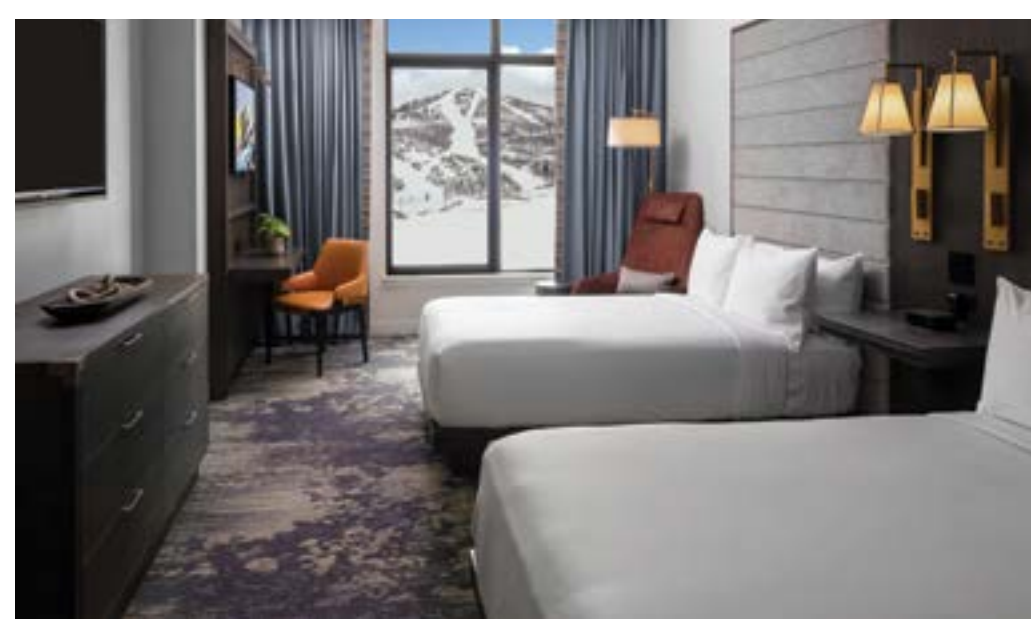
View of Deer Valley Resort from room with two double beds.