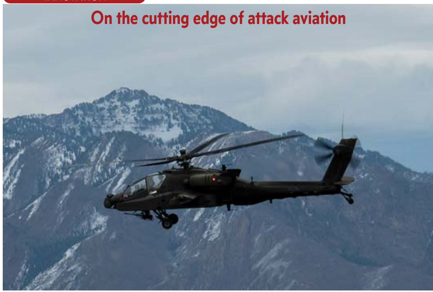
Utah Army National Guard's 1st Battalion, 211th Aviation Regiment welcomes the new AH-64E Apache Guardian into its ranks in West Jordan, Utah, Nov. 23, 2024. These are the most advanced attack helicopters to date, enhancing the Utah Army National Guard's air lethality.

S tories abound of the fear struck in the hearts of enemies of the United States when they see the dreaded Apache helicopter fly through the skies or hear its iconic sound. The Utah Army National Guard is among the very few hosts to the attack aviation units of the United States Army. With its 1st Battalion, 211th Aviation Regiment, or Attack Reconnaissance Battalion, affectionately referred to as the Air Pirates, the battalion is home to the newest AH-64E Apache Guardian.