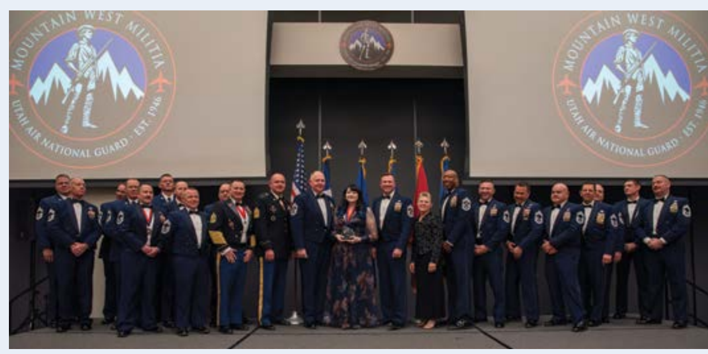
Winners of the 2024 Utah Air National Guard Airmen of the Year awards pose for a group photo following the award banquet held Jan. 11, 2025, in Midvale Utah. These Airmen are recognized for exceptional job performance, leadership and personal achievements.

The following Airmen received awards for their contributions above and beyond the expected standard in their positions and respective categories: