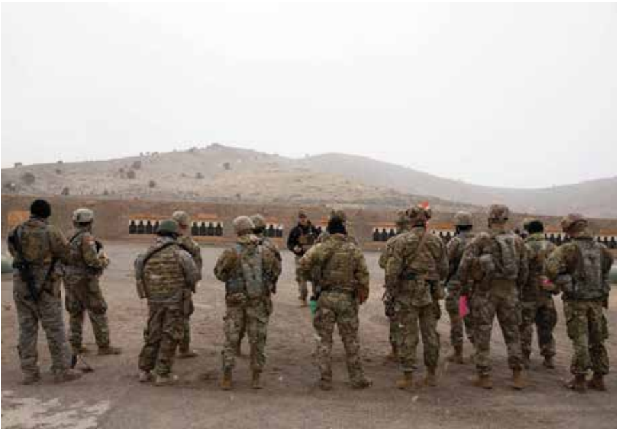
Utah National Guard Soldiers prepare to compete in the 9mm pistol portion of the Utah National Guard Best Warrior Competition on Camp Williams.