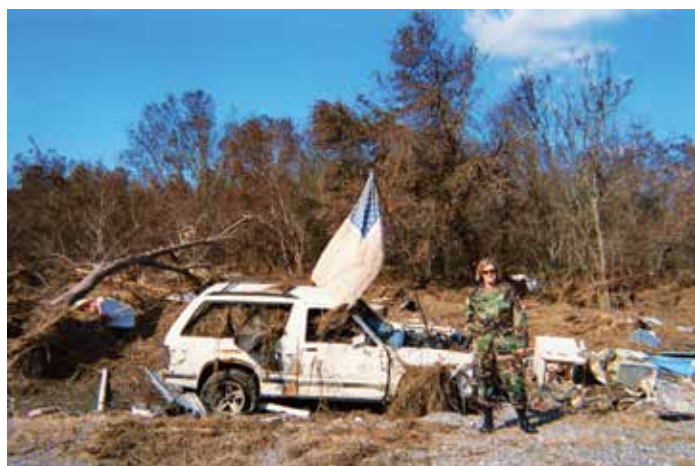
Capt. Charlene Dalto stands in front of some of the debris piled up along the road from the devastation communities faced in the aftermath of Hurricane Rita in Louisiana in 2005.

One of the most difficult things about deploying in 1990 was the limited lines of communication to those left back home. The only means of communication for the more than 400 people in the 144th was a land-line phone. There were long-waiting lines and virtually no privacy