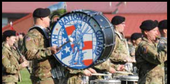
Soldiers, Airmen and Family members of the Utah National Guard (UTNG) took part in the 63rd Annual Governor's Day parade and events on Camp Williams in Bluffdale, Utah Sept. 16. The day's events were free, open to the public and included the parade, military aircraft flyover, cannon salute, music by the UTNG 23rd Army Band, classic car show, military equipment displays, information booths and more.