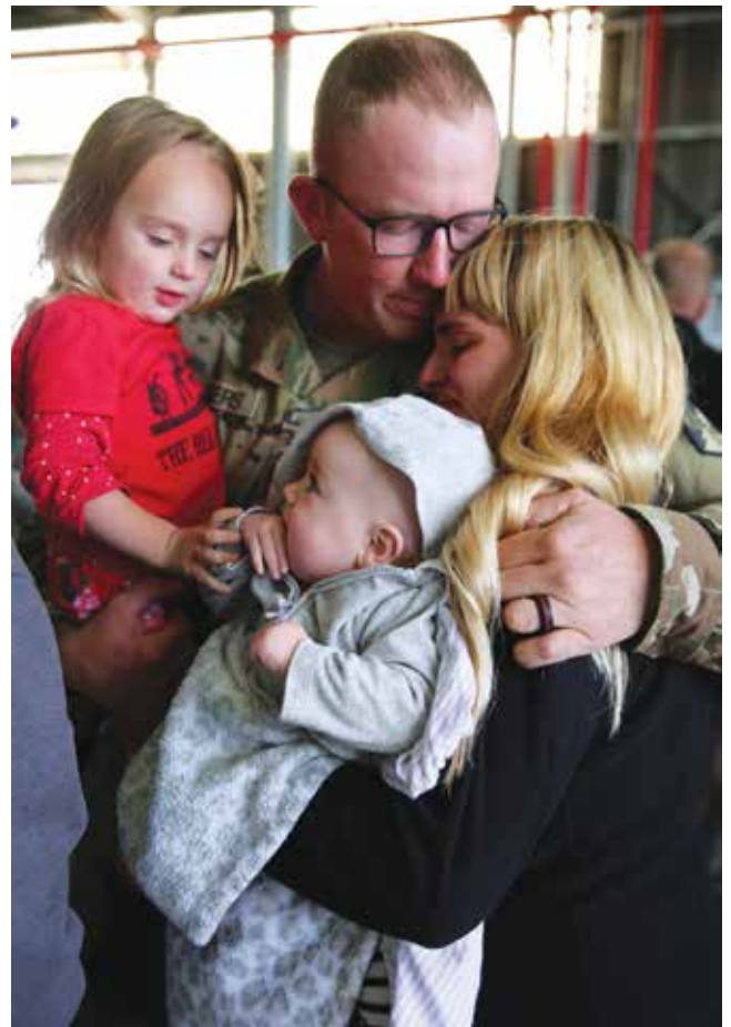
Members of Delta Battery, 1st Battalion, 145th Field Artillery gather at the Wright Air Base to say farewell to family and friends before boarding a plane to begin their deployment Oct. 1.