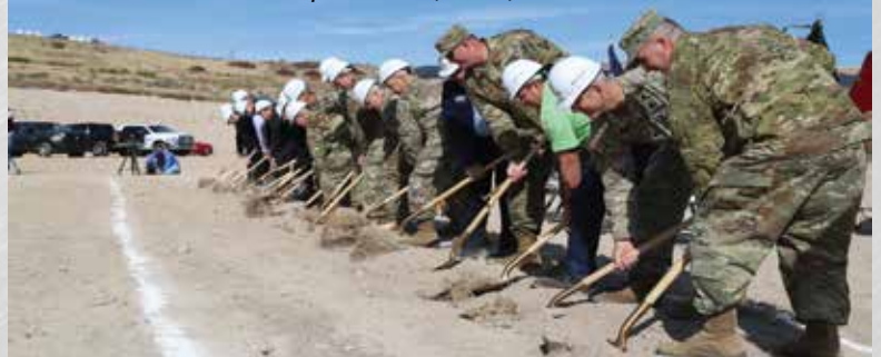
Utah National Guard members, construction managers and local civic leaders break ground for the future 19th SFG (A) Readiness Center at Camp Williams, Utah, Oct. 17.