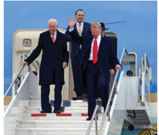
President Donald Trump, Senator Orrin Hatch and Senator Mike Lee arrive at the Roland R. Wright Air Base Dec. 4.