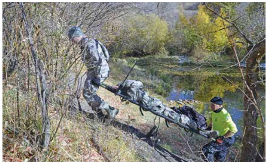
Airmen from the Utah Air National Guard's 151st Medical Detachment-1, and a member of the Davis County Sheriff's Department transport a simulated patient during the Tough Blooder competition on Oct. 14.