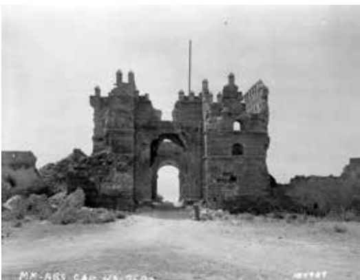
U.S. Soldiers landing in Morocco during Operation Torch. Kasbah after U.S. attack.

CASABLANCA, Morocco — On Nov. 8, 2017 the Utah National Guard partnered with the Royal Moroccan Armed Forces to commemorate Operation Torch, the first major offensive against Nazi Germany in WWII.