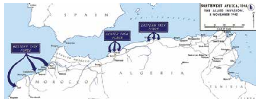
Operation Torch map of landing areas.