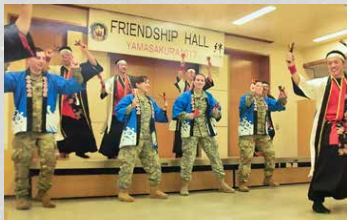
Top down: Bilateral-logistics-support team group pic, sky view of Yama Sakura 73 tent city, bilateral coordination during the exercise, and Japanese cultural exposure.