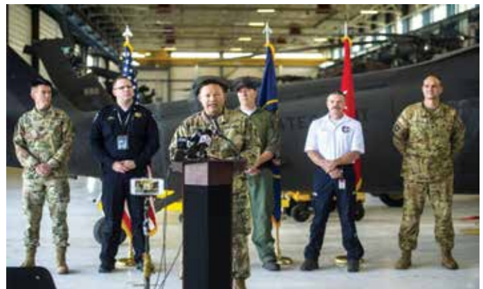
Lt. Col. Steven Fairbourn, public affairs officer for the Utah National Guard, speaks during a press conference at Utah National Guard's Army Aviation Support Facility Oct. 19. Also speaking at the conference were members of the Department of Public Safety, Summit County Search and Rescue and Life Flight.