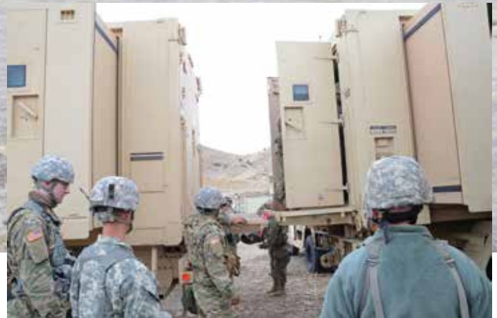
A new brigade-command-post concept was setup and tested by Soldiers with Headquarters, Headquarters Company, 204th Maneuver Enhancement Brigade during a field-training exercise at Camp Williams, Nov. 3-5.

CAMP WILLIAMS, Utah — Soldiers with Headquarters and Headquarters Company, 204th Maneuver Enhancement Brigade (MEB), tested a new brigade command post concept during a field-training exercise at Camp Williams, Utah, Nov. 3-5, 2017.