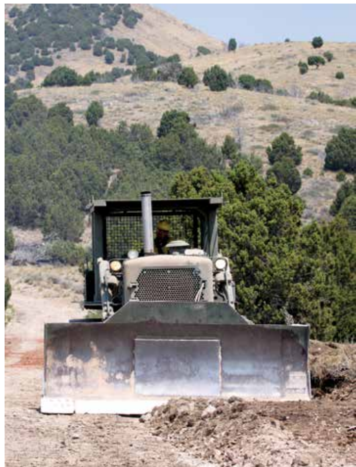
A UH-60 Black Hawk carries a Bambi Bucket for water drops. Bulldozer crews at Camp Williams prepare to cut fire breaks. An ariel view of Camp Williams after the Herriman Fire in 2010. A Black Hawk crew drops water on the Pinyon Fire in 2012. UFA and Guardsmen collaborate on fighting the Pinyon Fire.